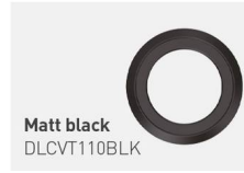
Matt black DLCVT110BLK