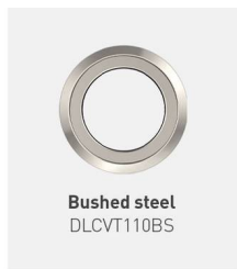
Brushed steel DLCVT110BS