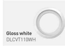
Gloss white DLCVT110WH