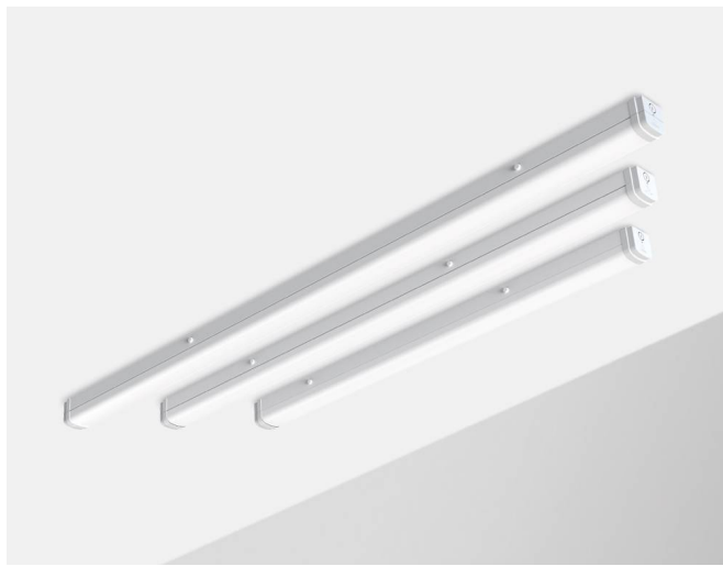
CCT Colour & Wattage switchable