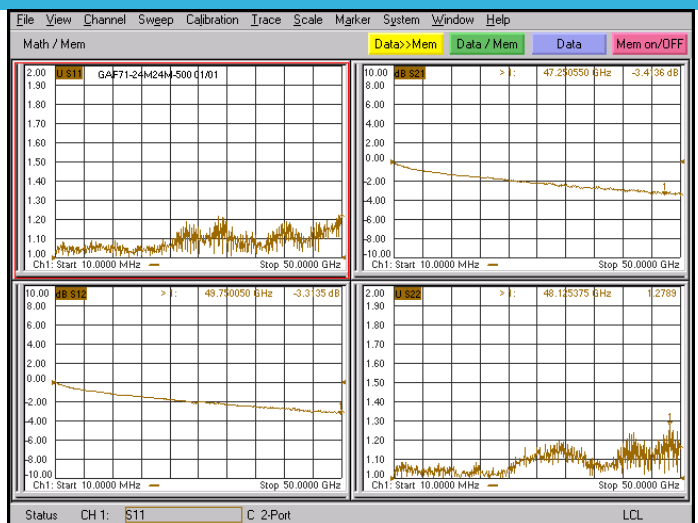
*Note: Test Cable Assembly Length = 500 mm