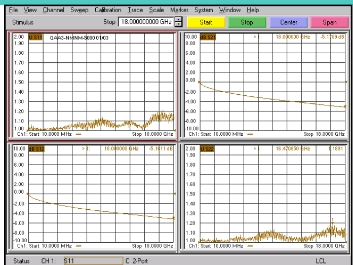
*Note: Test Cable Assembly Length = 5000 mm