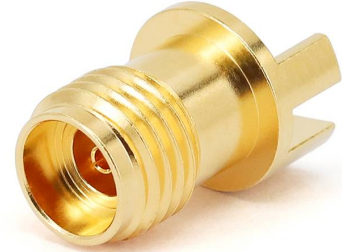
Dimensions are in mm