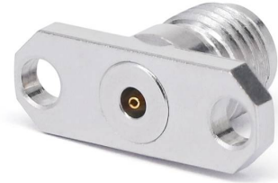
Dimensions are in mm