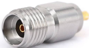
Dimensions are in mm