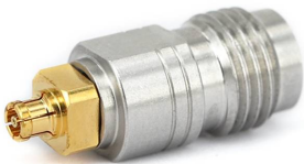
Dimensions are in mm