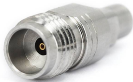
Dimensions are in mm