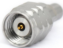
Dimensions are in mm