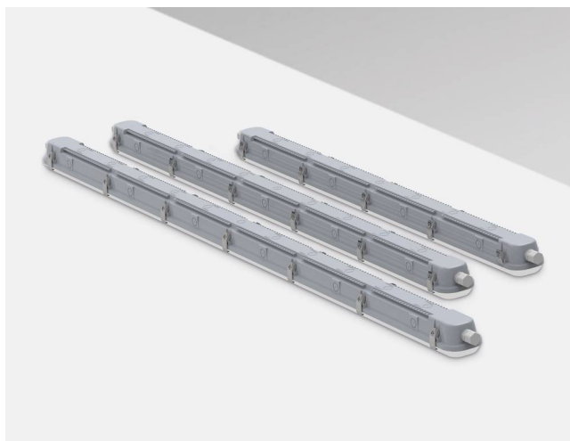
Unique full-length mounting slider